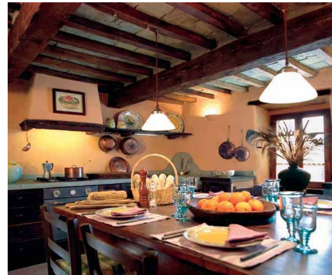
THIS PAGE: Situated at the top of the property, the pool overlooks the Niccone Valley; the kitchen in the largest residence. OPENING PAGE: The stone cabins of Borgo di Vagli.